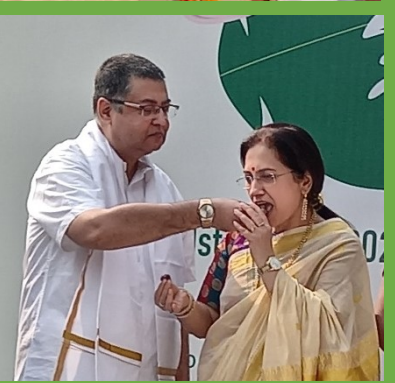
Glimpses of the District program: Clockwise from top Right: 1. Inauguration of Kerala Food Fest by Hon DG and the First Lady. 2. Celebrating Hon DG's marriage anniversary: a candid moment. 3. Cultural program on Kerala. 4. Rotary Club of Geetanjali Kolkata (RCGK) members with DG and the First Lady.